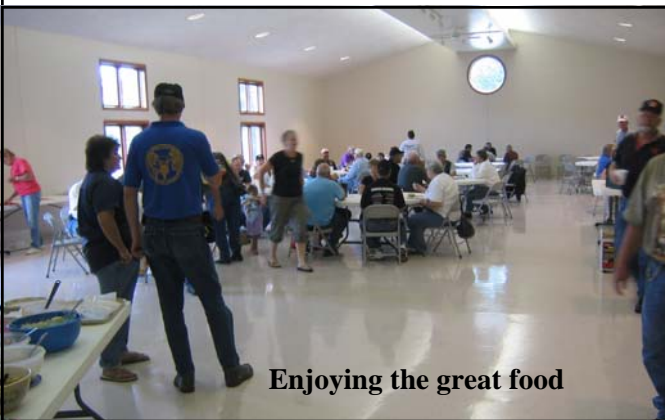
Enjoying the great food