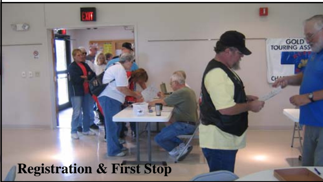
Registration & First Stop