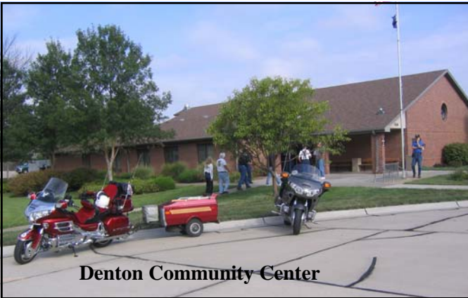
Denton Community Center